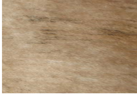
Light to White