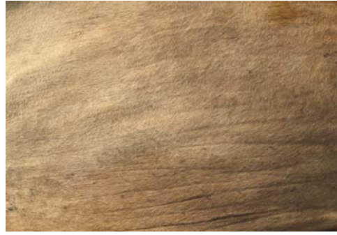
Brown or Grey