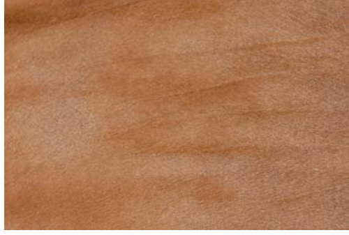
Orange to Medium Red