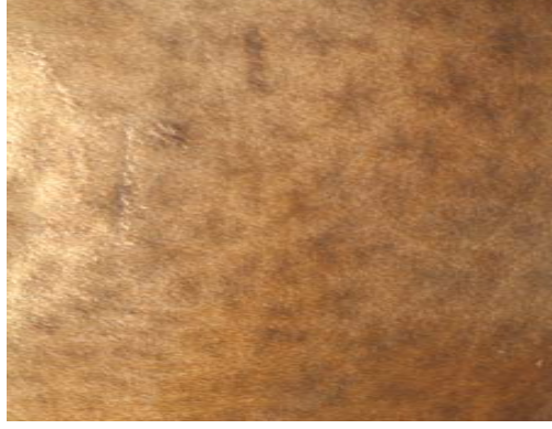
Red Variegated Pattern