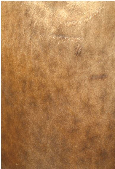
Red Variegated Patten