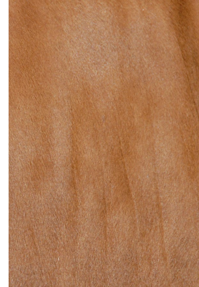
Orange to Medium Red