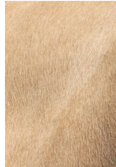
Yellow with no shading to white