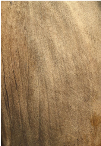
Brown or Grey