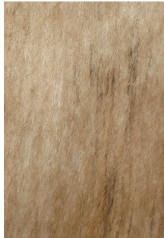
Light to White